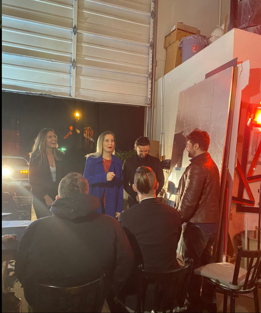
Top Photos left and right: behind the scenes filming independent feature film 'Footlights' Bottom Photo: cast and makeup department behind the scenes for the short film 'House of Moths'